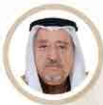
ABDUL AZIZ AL HAMIDI Saudi Arabia