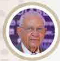
MORSI ARAB Egypt